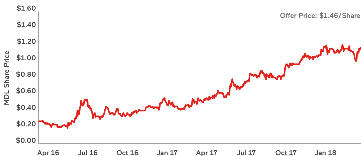
FIGURE 2: MDL HISTORICAL SHARE PRICE PERFORMANCE PRIOR TO THE ANNOUNCEMENT DATE

If the Offer becomes unconditional but ERAMET does not acquire 100% of MDL, then, depending on the circumstances at the relevant time, the liquidity of the Shares may be substantially reduced which would further reduce your ability to readily dispose of Your Shares in the future.